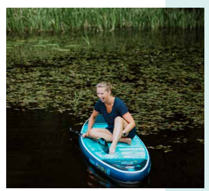
And there's paddleboarding. Have a go at this popular way of getting out onto the water.

Ljungby is a municipality with plenty of waterways, with Lake Bolmen at its heart. On the lake there is an island for all seasons. Bolmen offers canoeing, fishing, swimming, cycling and hiking around the lake, along the magical 130 km 'Bolmen Runt' bike trail.