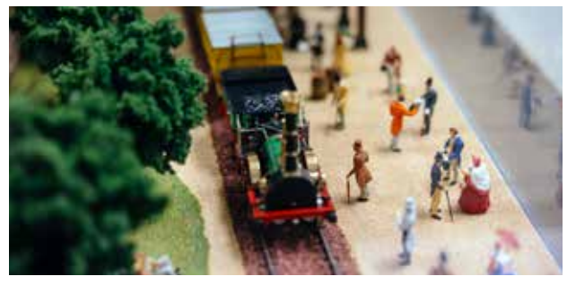
Discover the amazing miniature village at Minivärlden.

of shade for the little ones. The water is shallow, there is a play area nearby and places for barbecue. The swimming spot is near Bolmstad harbour, and my son loves going there to watch the boats. While there, we usually have a snack at the harbour café."