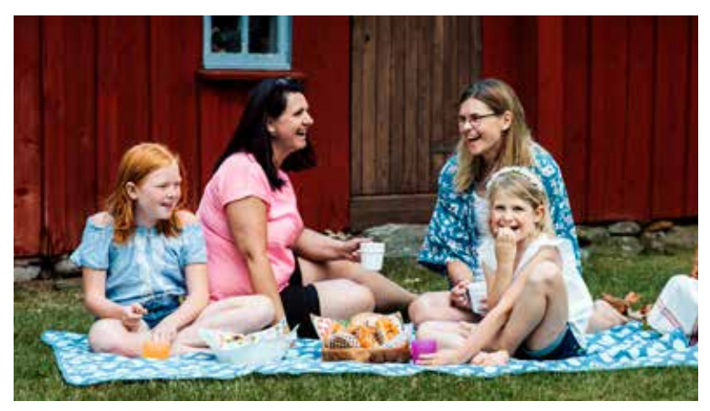
Bring along a picnic on your voyage of discovery in Sagobygden.