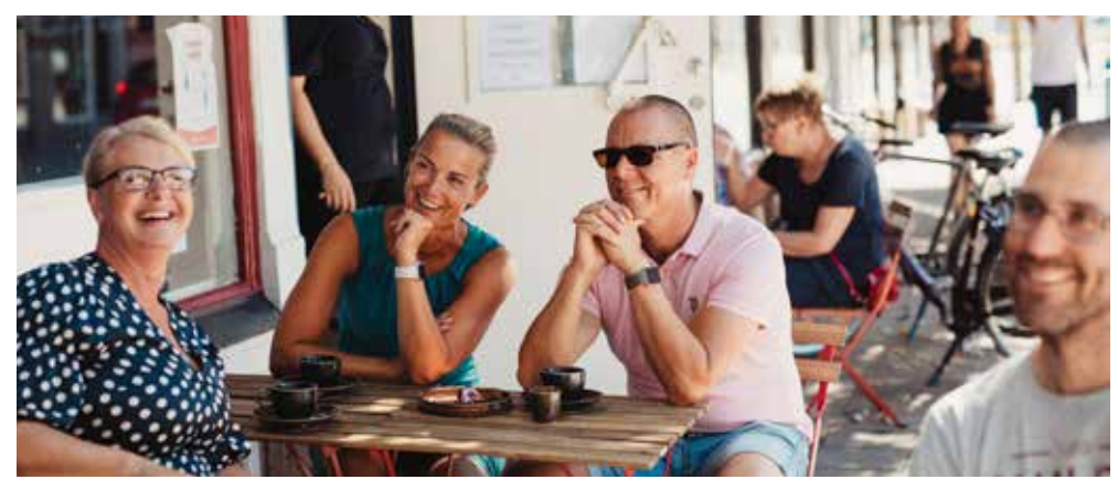
And it's a fantastic summer town.