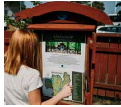
Sagobygden: recognised by UNESCO

Scan the QR code and listen to the whole story.