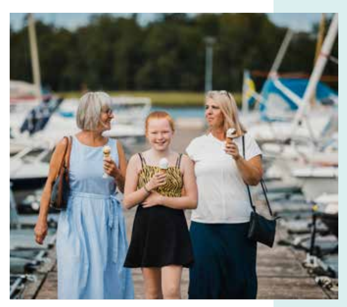
Make the most of being close to the water.