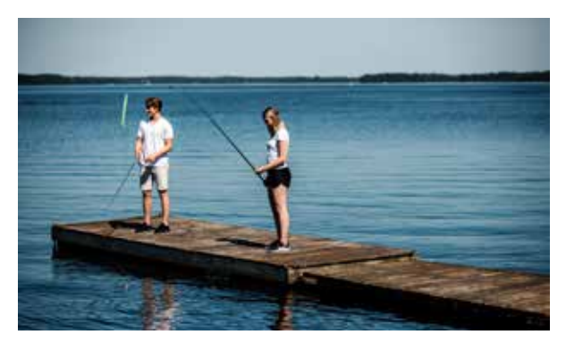
These lakes are great for all ages.

Pike-perch is a delicious fish for eating, and it's often found in deep waters. It is most active at sunrise and sunset. One of southern Sweden's most popular pike-perch fishing lakes is Vidöstern, with catches of over 10 kilos. But with a bit of skill you can also catch it in lakes such as Bolmen or Flåren. Fish species that have been introduced, such as rainbow or brown trout, can be caught at Vällingasjön and Hjärtanässjön.