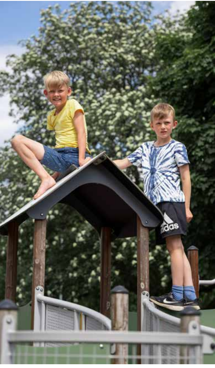
Time for relaxation and play.