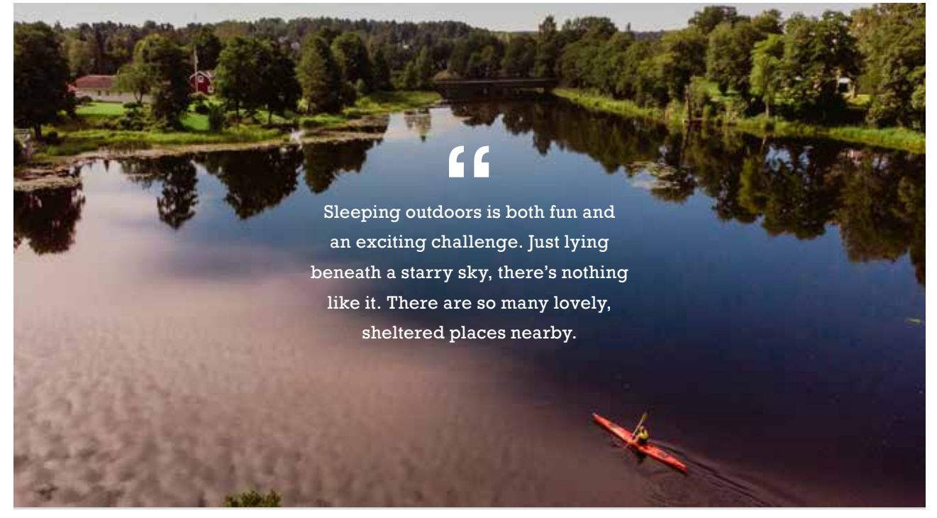
See nature from a kayak.